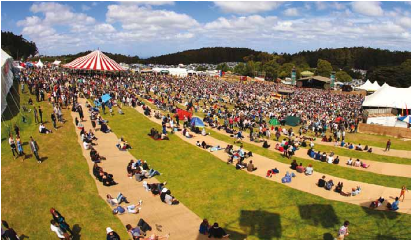
Falls Festival